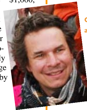
Greg Mortenson, co-author, Three Cups of Tea