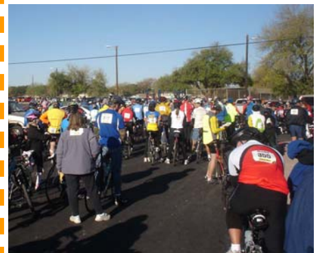
Hundreds of cyclists participate in the Mission to Mission Charity Bike tour on December 6, 2008