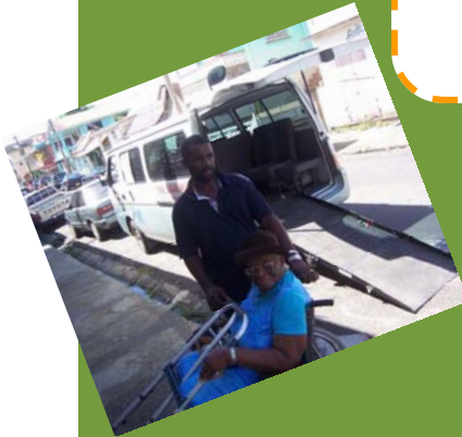
Community partner strikes a pose next to the Lifeline Ministries “Dial-a-Ride” bus. The bus is sporting new tires, which will help the driver navigate passengers safely through the winding roads of Dominica!