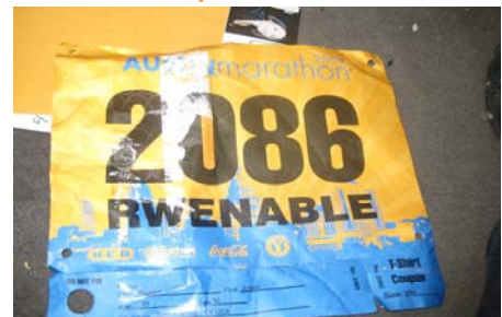
Edwin's number representing RWE.